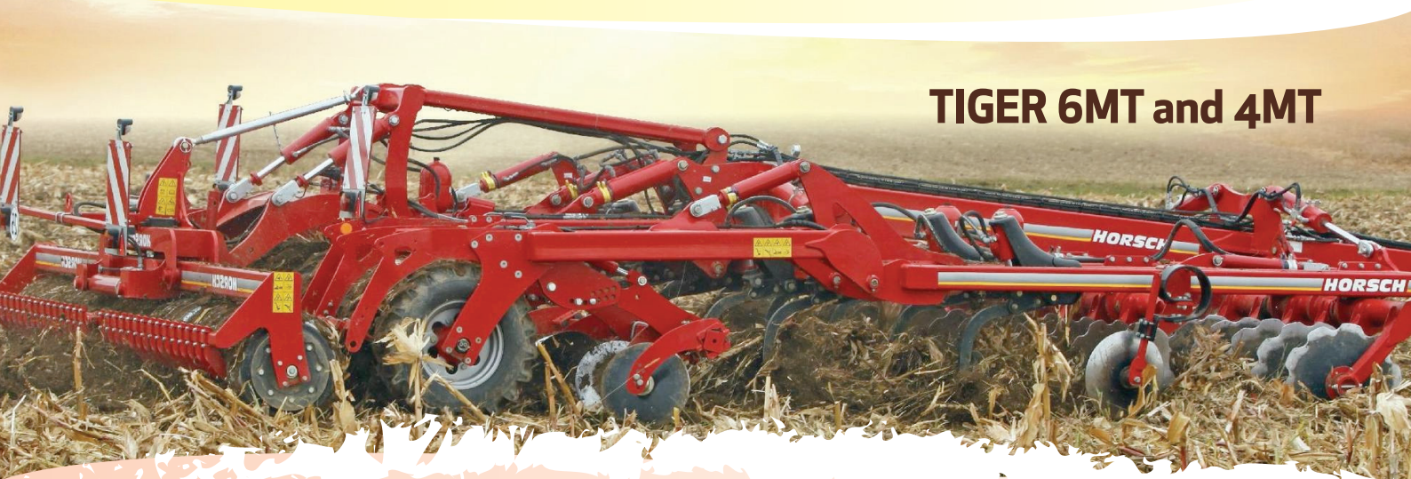
TIGER 6MT and 4MT