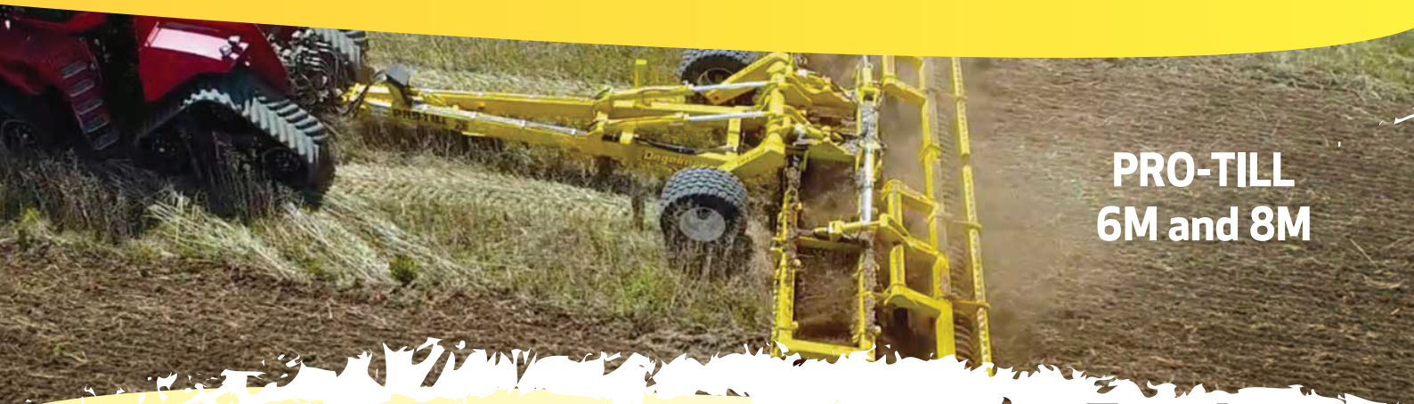
PRO-TILL 6M and 8M